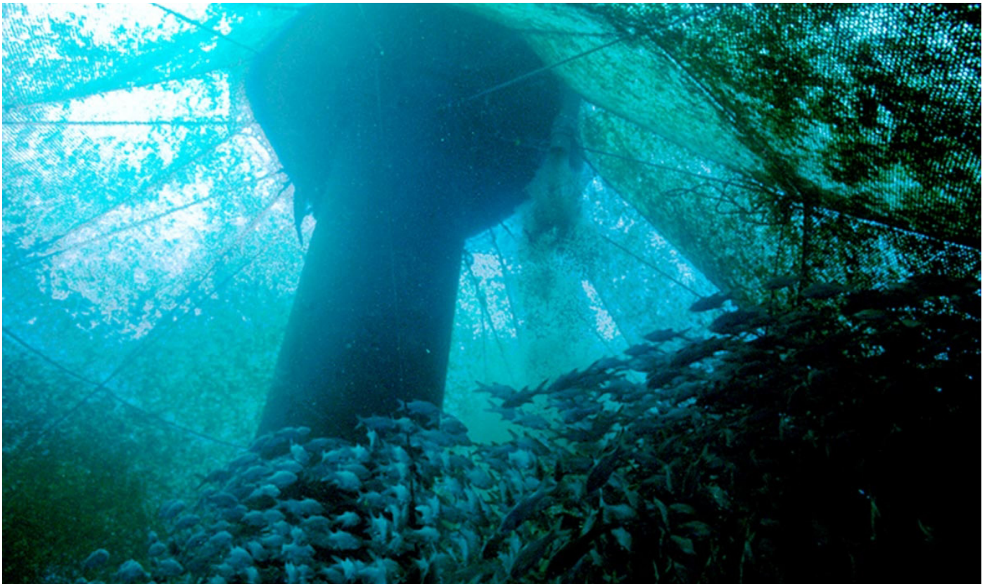
An offshore aquaculture cage off the coast of Hawaii.